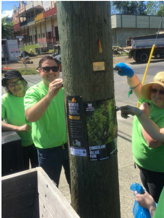
Community Impact Day in Cumberland, 2017.