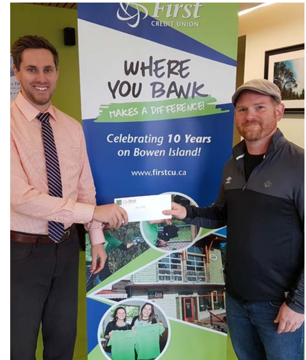
Presenting a sponsorship cheque for Leaders In Training , 2017

Aside from the financial results, throughout this annual report you will read about the many ways in which First Credit Union is making a difference, both in terms of monetary and in-kind contributions to our membership and community. We are pleased to share our positive financial results and talk about effective strategy, but ultimately, our membership and our communities are at the heart of our desire to create a sustainable future for the organization. We exist both for, and as a result of our membership and the communities we serve, and know that together we can build a strong member-owned cooperative for years to come.