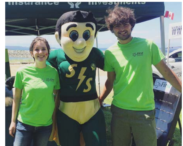
CULEAD Students at Canada Day Celebrations, 2017

We seek opportunities to build relationships with members of our community with outreach programs and events. Many of these programs focus on developing young leaders because we believe that investing in our youth is paramount to the positive social and economic future of our communities. In addition to a robust scholarship program, we offer a CULEAD young leaders program to grade 12 students planning to further their education. Our CULEAD program gives students the opportunity to gain practical experience and mentoring from business professionals on a wide range of topics. Over 100 students have participated in the young leaders program since it was established in 2001.