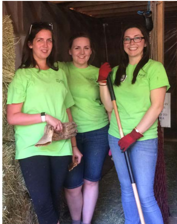
Community Impact Day, 2017